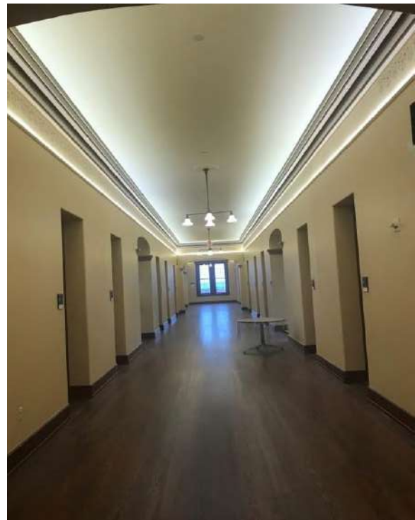
Photo of a hallway in the main DHS facility at St. Elizabeths. Each door leads to an office that used to be a bedroom in the mental hospital.

Because the entire site is an historical landmark, GSA has had to work around D.C. preservation regulations, including maintaining the exterior façade of key buildings. 15 So when GSA and DHS gutted the interior of the buildings, they kept the exteriors intact to use as shells for newly constructed buildings within the walls of the originals. 16 In 2010, GSA learned the buildings lacked adequate