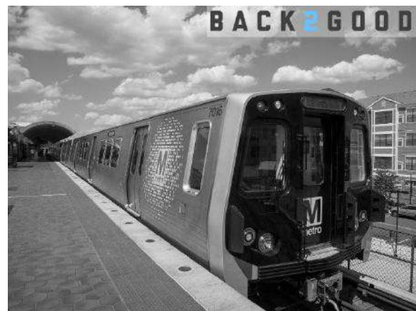
Metro's Back2Good program appears to not have improved public sentiment.

Recently, rather than using its service to improve public perception, Metro launched a $400,000 public relations campaign, aptly titled “Back2Good,” to entice commuters back. 11 If you are questioning the reasoning of spending so much money on a PR campaign, you are not alone. The Washington Post reported that “some were surprised at Metro's decision to spend six-figures on a PR campaign during a budget crisis, when the agency [was] considering raising fares and reducing service to offset a