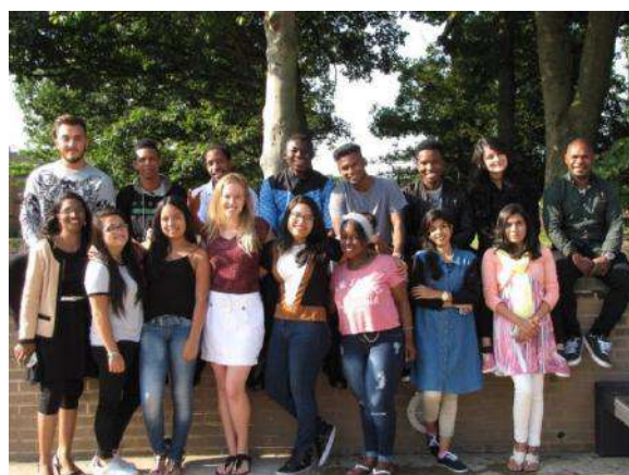
CCI students at the Alexandria, VA, campus of the Northern Virginia Community College.

While the State Department hasn’t nailed down the countries of origin yet (and leaves itself room to make other adjustments along the way 12 ), they have so far determined that the lucky students will get to enroll in one of the following areas: agriculture, applied engineering, business management and administration, early childhood education, information technology, media, public safety, or tourism and hospitality management. 13 For some reason, this list excludes several disciplines that would be valuable in many