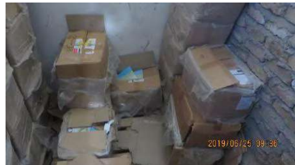
Some of the 154,000 USAID-funded textbooks sitting in storage, with these located at the Herat Field Office in Enjil, Herat, Afghanistan.

There appears to be more to the story, however, as a review by the Special Inspector General for Afghanistan Reconstruction (SIGAR) found in part that “[p]rincipals and teachers at a quarter of the schools inspected stated, ‘that the books were no longer in usable condition.’” 88 Along the way, SIGAR also found significant “book quality deficiencies, such as, loose or blank pages, misspellings, and low quality paper.” 89