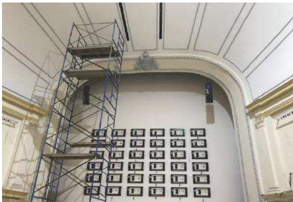
Photo of the auditorium on site at St. Elizabeths. Despite being inside the secure perimeter, the public will maintain access to it after DHS moves into the facility.

Meanwhile, there are portions of the site which are “restricted for development” due to historical and environmental concerns. 19 GSA and DHS have also agreed other portions of the site – inside the secure perimeter – must remain open to the public. 20 The surrounding community will maintain access to the site, albeit on a limited and supervised basis, to visit a hilltop from which community members traditionally watch Fourth of July fireworks, visit the cemetery on site, and use an auditorium. 21