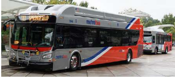
Metro says, 'Use Lyft!'

service at that time, called its “After Midnight Service.” 22 While Metro cited schedule changes in its rail service as the reason for the program, 23 the development was not exactly universally praised by those targeted. 24