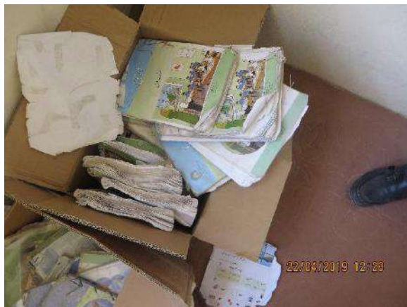
Unusable textbooks at an Afghan school, paid for with Americans’ tax dollars.

The failure was part of USAID’s Afghan Children Read (ACR) program, a 5-year program taking place from April 2016-April 2021 (with the full cost expected to clock in at $69,547,810). 85 According to USAID, the ACR is a joint effort between it and the Afghan Ministry of Education (MoE) “1) To build the capacity of the MoE to develop, implement, and scale up a nationwide early grade reading curriculum and instruction program in public and community-based schools; and 2) To pilot evidence-based early grade reading curricula and instruction programs to improve reading outcomes for children in grades one through three in public and community-based schools.” 86