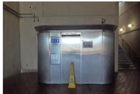
Photo of the half-million-dollar toilet facility. Metro left the facility broken for two years before taking it out of the Metro station. Photo Credit: Wikipedia Commons / Ser_Amantio_di_Nicolao, via WAMU. https://wamu.org/story/19/07/26/inspector-general-found-wmata-spent-416000-on-a-self-clean .

To top it off, the half-million-dollar toilet sat broken and abandoned in the Huntington Station from 2017 to early 2019. 32 Metro contracted with a private company to clean and maintain the self-cleaning toilet but canceled the contract in 2017. 33 While Metro had plans to move the toilet to a different station, 34 it ended up decommissioning and removing the facility in early 2019. 35 FSO staff inquired about the current whereabouts of the toilet, but Metro was unable to provide an answer.