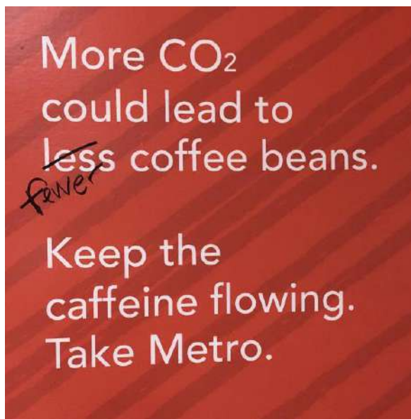
An intrepid Washingtonian took the time to edit the grammar of a Metro ad at Metro's Navy Yard stop, an ad that plays on fears of climate change.

The Post also noted that "Back2Good isn't the first time in recent history Metro has forked over a pretty penny for public relations," pointing out that "[w]eeks after a smoke calamity took a woman's life at L'Enfant Plaza in January 2015, Metro hired two high-powered public relations firms to assist the agency with image control. The cost of those hires: $250,000," adding, "In that case, the costs were covered by Metro's insurance carrier, AIG, according to an agency spokeswoman." 13