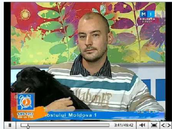
Animal welfare activist appearing on Moldova's state-owned network, Moldova 1.

Their article was written in context of a then-recent development in Moldova. On January 10, 2018, more than five months before the deadline for this grant application, 35 Andrian Candu, acting president of Moldova at the time, approved a law “ban[ning] most television and radio programs not produced in the European Union, the US, or Canada, or by the states that have not ratified the European Convention on Transborder Television,” 36 according to a news report. Radio Free Europe/Radio Liberty has also reported the move “effectively bans the rebroadcasting in Moldova of Russian television programs on news, analysis, politics, and military issues.” 37 So the Moldovan government is already moving to counteract certain Russian influence