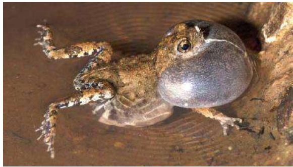
Túngara frog mid-mating call.

So what did the researchers determine? In short, urban life seems to have benefited the male frogs, who “call at higher rates” and have a more complex, attractive mating call than their forest-dwelling counterparts. 70 While the male urban frogs “experience higher competition for mating opportunities,” they also face less risk from predators. 71